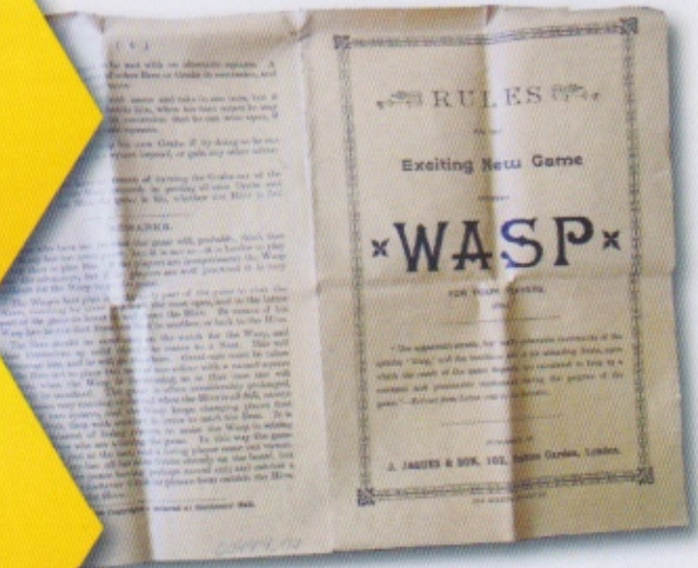
WASP Rules for play