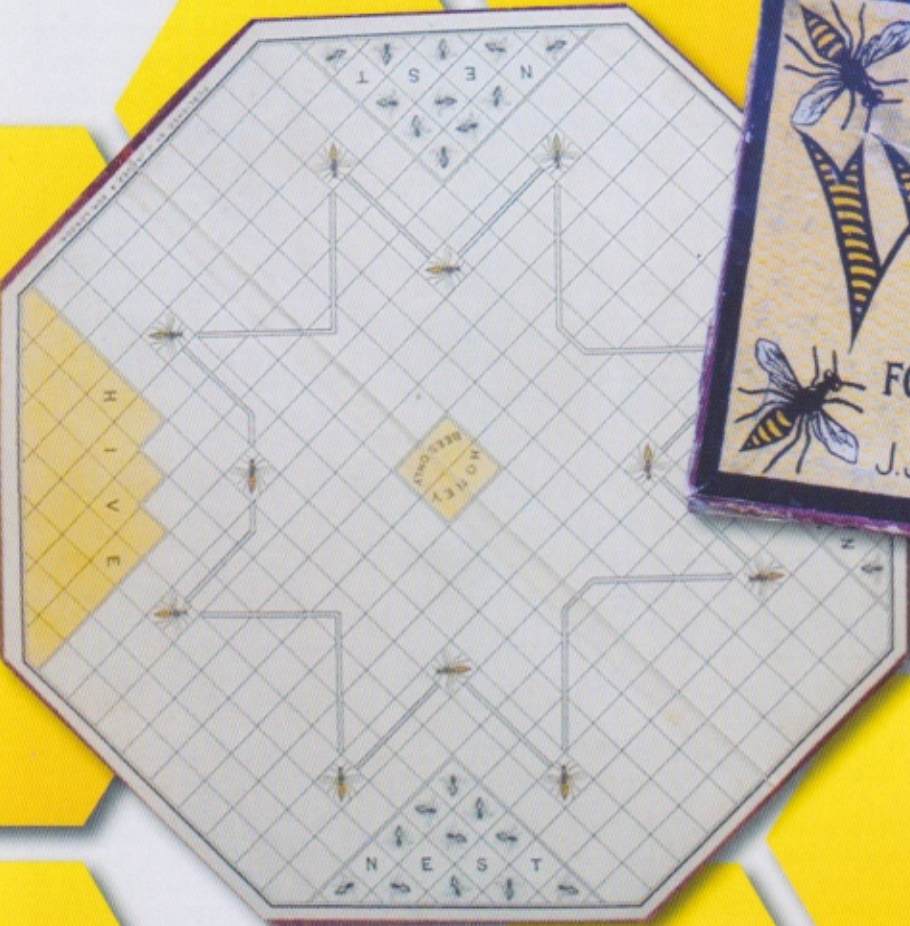
WASP game board